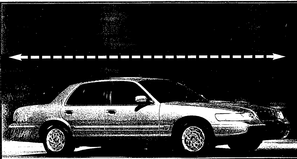
2002 Grand Marquis GS

Memorial contributions may be made to Catholic Central High School, 14200 Breakfast Drive, Redford, MI 48239.