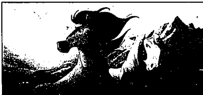
Dreamworks SKG's Spirit: Stallion of Clmarron