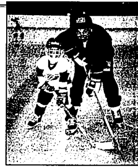
When I was four, and now that I'm almost 14, my Dad will always have time for me. He's the best!