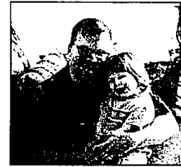
I look just like my Daddy as you can see; I love him and he loves me!