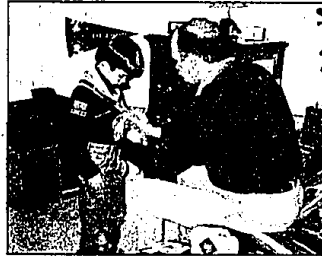
Dads and Cub Scouts just go together. This was taken when I joined Cub Scouts. Now that I'm 13 years old my dad is still there for me.