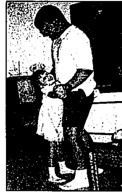
This is my favorite picture of my Dad and I because even though he is very busy, he always makes time for playing with me, helping me with homework and he teaches me new things. I love my Dad.