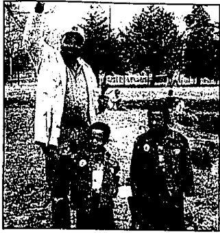
We caught this fish at the kids fishing derby held in Shiauasse Park. The fish was trying to get off the hook. We let Dad hold the fishing rod. We kept an eye on the fish while taking the photo. We'll need you next year when we catch a bigger fish.