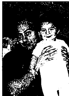
I love when my Dad gets me ready for bed!