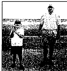
This is my favorite picture of my Dad and I, because I like to fly kites with my Dad on the beach of Kawai Island.