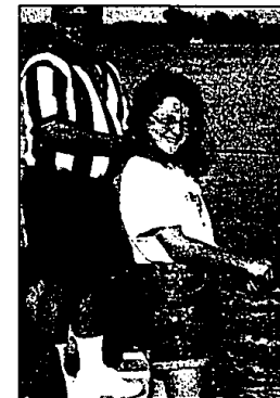
This is my favorite picture of my Dad and me because we both love to go fishing. Every summer when we go on vacation, my Dad takes me to a lake and we fish together. I love spending time with my dad, and fishing is a great way to do it. I love you Dad! Happy Father's Day!