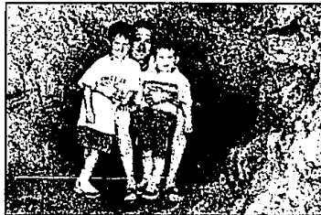
My Dad came to hold me every day in the hospital for six months and I know he loves me very much