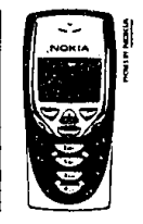
NEXT GENERATION NETWORK BY NOKIA

> mMode™ - get the latest news, email, find restaurants, shop online and more, all from your wireless phone, for an additional monthly and usage fee