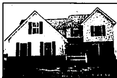
Rolling Oaks: This colonial, the Cherry Model, comes with three or four bedrooms and 2-1/2 baths.

Three plans carry a base price of $224,900. These include a first-floor master of 1,839 square feet, and two colonials, one of 1,900 square feet and the other of 2,105 square feet. All