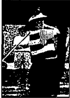
Mercy alumna Meg Mallon became a star on the LPGA Tour.