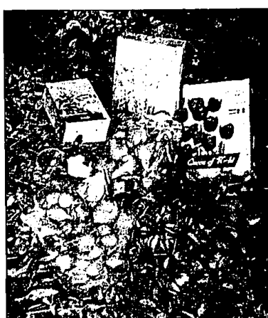
Bulbs for spring gardens can soon be planted.

Two exciting programs about bulbs that you won't want to miss will take place Sunday and Monday, Sept. 22 and 23, at Telly's Greenhouse, 3301