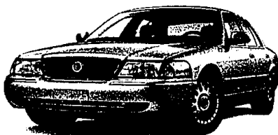
2003 MERCURY GRAND MARQUIS GS