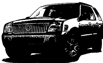
2003 MERCURY MOUNTAINEER LUXURY V-8