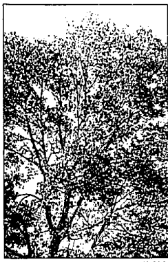
The stately maple in our back yard is simply beautiful each year at this time.

There are short lived beauties like the first touch of frost blackens them overnight, but the memory of the beauty will last a long time.