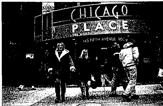
Combine holiday shopping and a mini vacation in Chicago.

"Toronto is a shopper's paradise, especially with the U.S. exchange rate," said Ellen