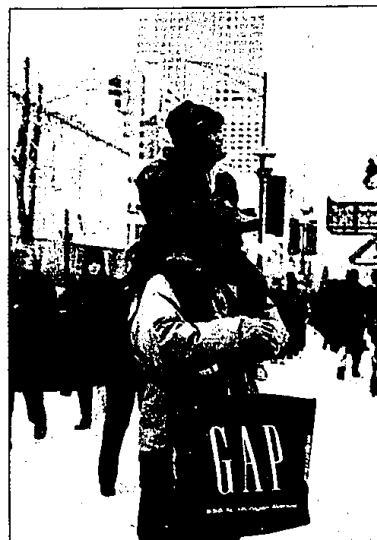
A youngster rests his feet and gets a "ride" while shopping in downtown Chicago.