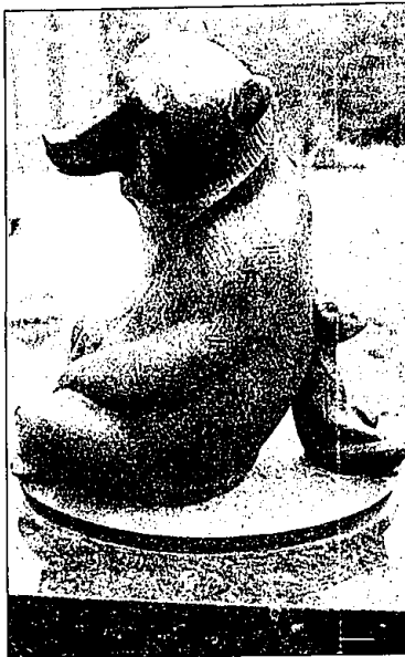
Sculpture by Marshall Fredericks.

Sepeshy's paintings are known for their sensitivity plus unique brushwork in the medium of egg tempera. His works are in major museum collections including the Metropolitan Museum of Art and Albright-Knox Gallery in Buffalo.