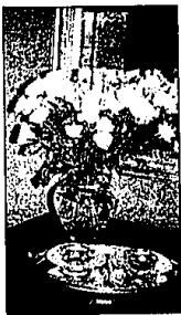
MARYLISLY White flowers (roses here) and mirrors reflect light and add sparkle.

The coming year will see jewel tones used in home decor, so why not get ahead of the game and choose flowers in those colors? This is also a good way to introduce a new palette of color, in a small way so that you can see the way they work in your surroundings before you bring in a more permanent new color. For instance, royal purple, cerise (bright red with a pinkish tinge) and red jewel tones are strong. Perhaps you have noticed them in ornaments, beads and vases that are now offered in stores. Ruby red, deep purple and strong pink are contenders. Any of these colors are wonderful used with silver or gold bowls filled with a jewel-tone flower, and plum blooms and glass balls will complement such an arrangement. Try a mixture of purple or