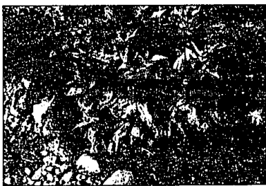
The zinnia remains a very popular annual.