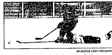
Redford Unified's Kevin Spoutz dives for the puck in an effort to stop Farmington's Matt Kijohede from gaining control.

GIRLS VOLLEYBALL Class A - 1. Grand Rapids Forest Hills Northern; 2. Fraser; 3. Grand Haven; 4. East Lansing; 5. Portage Central; 6. Temperance; 6. Redford; 7. Flint; 8. Carman-Ainsworth; 9. Muskegon Monsi Shores; 10. Livonia Ledywood; 10. Clinton Township Chippewa Valley. Division 2 - 1. Fenton; 2. Fenton; 3. (tie) Yale and Grand Rapids West Catholic; 5. Whitehall; 6. Alma; 7. Frankenmuth; 8. Coldwater; 9. Battle Creek Harper Creek; 10. Stuarts. Class C - 1. New Detroit; 2. Ravenna; 3. Galesburg-Augusta; 4. Montague; 5. Pewamo- Westphale; 6. Ionia; 7. St. Louis; 8. Concord; 9. North Muskegon; 10. Hancock. Class D - 1. Eastland; 2. Battle Creek St. Philip; 3. Pontiac; 4. Beal City; 5. Adrian Lenawee Christian; 6. Clima-Scotts. WRESTLING Division I - 1. Davison; 2. Clarkston; 3. Temperance-Redford; 4. Clinton Township Chippewa Valley; 5. Novi; 6. Grandville; 7. Roselle; 8. Redford Catholic Central; 9. Bay City Western; 10. Walled Lake Western. Division 2 - 1. Lowell; 2. Lapeer West; 3. Stevensville Lakeshore; 4. Flint Keastley; 5.