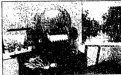
These are some of the items on the auction block at the Plymouth Community Arts Council fund-raiser.

The Plymouth Community Arts Council sure knows how to throw a party. Last year's Western theme dinner and auction drew hundreds of supporters dressed in denim and cowboy boots. This year's '70s bash is proving just as popular. There are only 20 tickets left to the Friday, March 14, event, but party lovers can still take part in the fun while supporting a good cause. Wear your psychedelic prints, fringed vest and Frye boots to the Friday, March 7, preview party. You can bid on more than 100 items, including a signed Sergei Federov jersey, digital piano, Art & Crafts-style bent leg rocking chair, a one-week stay at a condo in Puerto Vallarta, jewelry, painted furniture, spa packages, tickets to the Detroit Symphony Orchestra, Detroit Pistons and Detroit