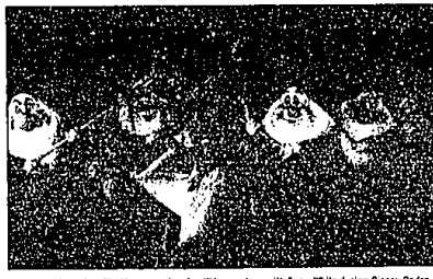
Fun-loving characters file the seven dwarfs will be on stage with Snow White during Disney On Ice .