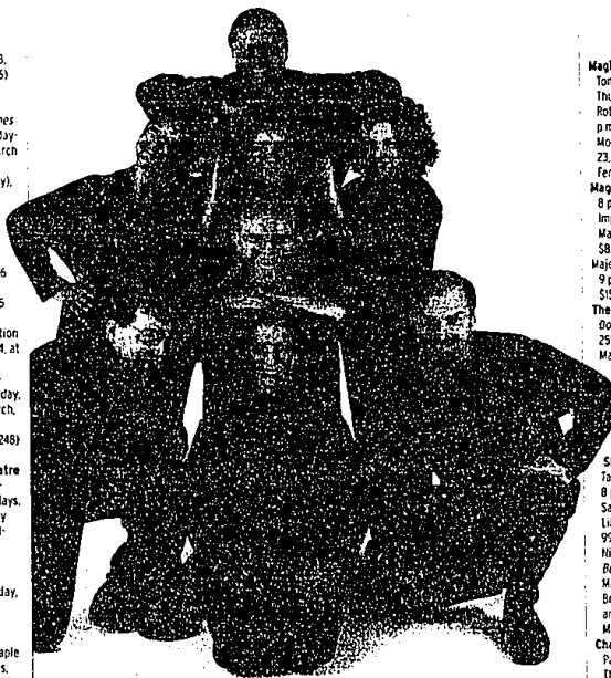
The improv theater group Empatheatre performs 8 p.m. Friday, March 14, at Kerrytown Concert House, 415 N. Fourth, Ann Arbor. This month's topic is "Divine Intervention." Empatheatre invites audience members to write down their stories, real-life and otherwise, which become a springboard for the performers. Tickets are $12 (first four rows $15), $10 seniors and students. Call (734) 913-9133.

New permanent Abraham Lincoln exhibit. Images of Lincoln, acquired from Michigan