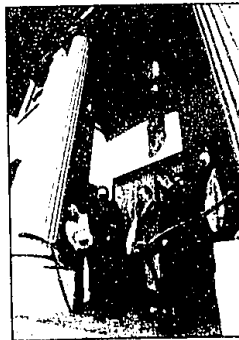
PLEASE SEE BANK, A5

Company officials held an open house and ribbon-cutting cere-