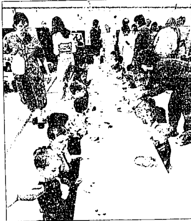
The crowd of youngsters belled up to the table for helpings of pancakes with maple syrup.

Sometimes parents from foreign countries are hesitant to read stories in their native language because they want their children to learn English. That's a mistake, Colliton said. "It doesn't matter what lan-