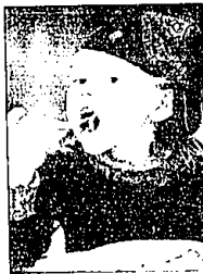
Taylor Spear enjoys another bite of pancake.

The pig starts out wanting to eat a pancake requiring syrup, which makes the pig sticky, which requires a bath, which requires some bubbles, which requires a toy and then a rub-