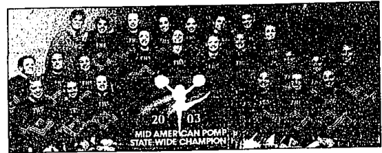
Farmington High's varsity pompon team captured top honors in state championship competition.

Representatives from the Farmington Community Library, Planning Commission, and Beautification Commission will also participate.