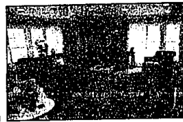
The former rec room is now a comfortable and warm family room, all dressed up for relaxation.

bathroom. A walk-in closet and a make-up area are adjacent to the bedroom and the new master bedroom. The addition of the master bedroom adds 300 square feet to the home, and also completes a U-shape in the back yard, creating privacy for the back patio area. The bedroom is blue with a grayish tint (Pamela's blue, Roland calls it). Pamela changed the traditional brass hinges with silver ones. The foyer area was painted red. The couple started three weeks before moving in and only finished in December. Roland completed the front porch and walk in a tumbled stone, along with landscape lights. Bradley pear trees were planted. "The trees are