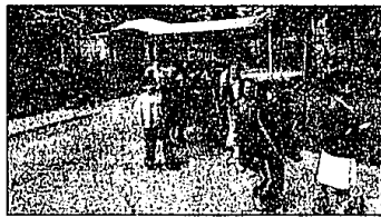
With the Longacre House tour over, Gill students head for the bus and lunch at Heritage Park.

The Longacre House, Inc. membership will hold an organizational meeting at 7 p.m. on Tuesday, June 10.