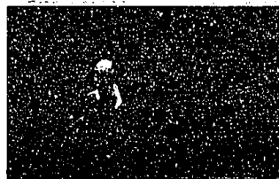
Ferns stand tall around a pedestal angel, giving cover for chipmunks, red squirrels, and rabbits scouring the garden floor for food.

"We do have one fountain. It's a lot of work to clean it, but the birds and squirrels love it," Barbara said. "We have a great diversity of wildlife. In addition to birds, rabbits, skunks,