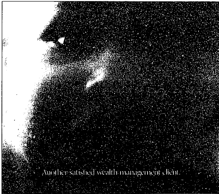
Another satisfied wealth management client.

Our expertise in estate planning helps protect your wealth for generations to come.