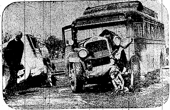
Six passengers in the big inter-city bus, shown above, were hurt when it struck the automobile of Miss Ruth Tuttle of Farmington near Toledo last Saturday morning. The bus sideswiped the machine and knocked it into the ditch, throwing Miss Tuttle upon the car-tracks which can be seen between the two vehicles in the picture above.