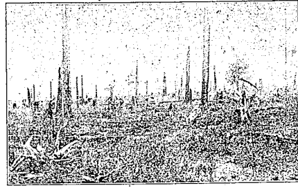
Such Land Could Easily Be Made to Produce More Pasture by Scattering Grass Seed and Piling Loose Logs.

Dean and Director Michigan Agricultural College.