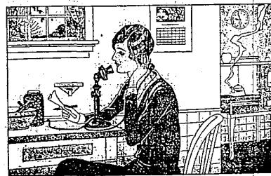
Ordering groceries at the kitchen telephone is the convenient way.

Many a steak has been burned while a telephone call was being answered. And countless unnecessary steps are taken daily, going from the kitchen to another room to make and receive