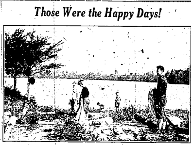
Those Were the Happy Days!