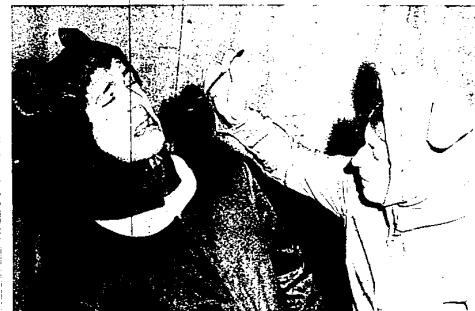
BAD MEDICINE? — "But you haven't tasted it yet. How do you know you don't like it?" asks Kanga of the reluctant Winnie-the-Pooh.