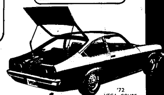
'72 VEGA COUPE

OPEN MON. & THURS. 'TIL 9:00 SATURDAY 'TIL 6:00