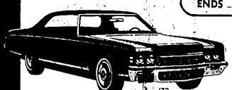
'72 CAPRICE SEDAN

BRAND NEW 396 cubic engine, still in the crate! Complete with everything but the exhaust manifold and carburetor. Full Chevrolet warranty. OUR PRICE $549 Displayed in our new car showroom, room