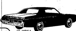
'72 IMPALA SPORTS COUPE

NEW 71 IMPALA FROM $2699 HURRY WHILE THEY LAST!