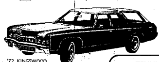
'72 KINGSWOOD ESTATE WAGON