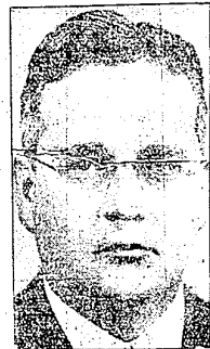
ROBERT G. YERKES