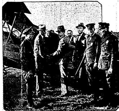
One million dollars in cash, weighing over 500 pounds, was carried from the Federal Reserve and other banks at Richmond, Va., to the First National bank of Danville, Va., which needed the money in a hurry. Our photograph shows the valuable cargo being unloaded at Danville.