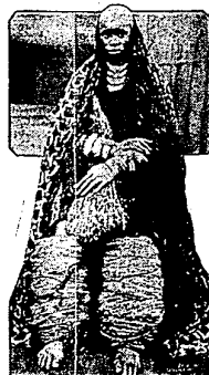
This is the wife of a native chief of one of the tribes that inhabit the Belgian Congo, with all her royal regalia. Her high rank is denoted by the many bracelets of metals and gold which she wears upon her arms, while her legs are encased from ankles to knees with several hundreds of yards of metal wire.