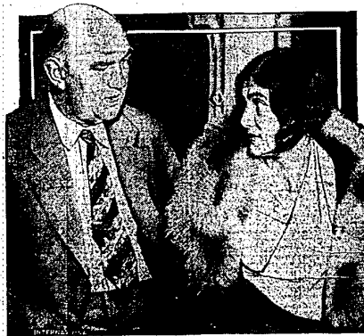
Shown above with her husband, Doctor Judd, is Mrs. Winnie Ruth Judd who, arrested in Los Angeles, confessed that she killed two women in Phoenix and shipped their bodies to Los Angeles in a trunk and suit case.