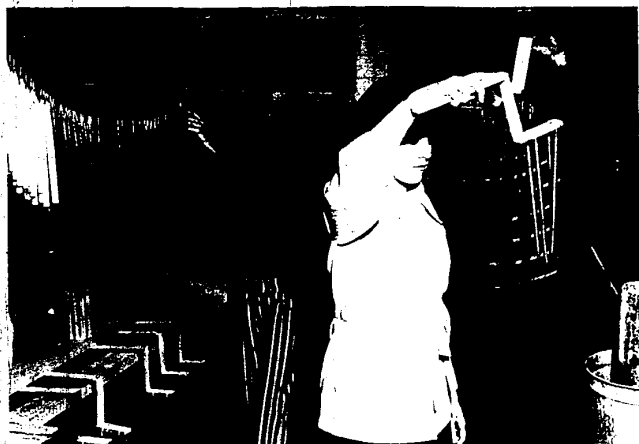
FOR CHRISTMAS -- Workers at New Horizons, a sheltered workshop for the handicapped operating at Grand River near Haggerty in Farmington, are making hand-dipped candles for sale as Christmas gift items. Shown working

He will now proceed to the next phase of training under the Naval aviation program and, upon completion, will be awarded the "Wings of Gold" of a Naval Aviator.