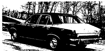
MORE "CHIRP" -- Plymouth's subcompact Cricket has increased H.P. (Horsepower) for 1972 with an optional twin carburetor system for its 4-cylinder, 91.4 cubic-inch (1500 cc) engine. New, also, are: an automatic choke for the standard engine, vinyl roof, and a list of bright colors. Arrived in two-door sedan.