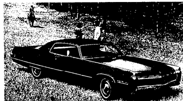
LONG, LOW and LUXURIOUS -- The Chrysler Imperial LeBaron enters 1972 as an all-new luxury car with simplified but elegant lines. In two and four-door hardtops. Wheelbase: 127 inches. The standard engine is a 440-cubic-inch V-8.