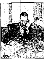
Clyde Tolson, Assistant Director, Division of Investigation, Department of Justice, Washington, D. C., talking over National 7117.

Accordingly, officials of the Department of Justice urge that the National 7117, be called immediately in all cases of kidnaping, thus enabling it to the Federal officials themselves to determine the nature of the action they should undertake. Therefore, a telephone num-