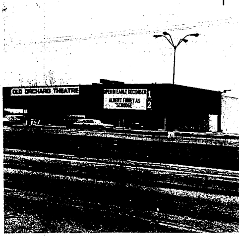
THE OLD ORCHARD 1 and 2, twin theatres located on Orchard Lake Road, north of 12 Mile, Farmington Township, will open Dec. 10. This will be the newest addition to the theater chain of Suburban Detroit Theatres, Inc.