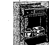
The "Kitchen Compact" comes complete with stand and the broiler. Try electric stove here.

this handy cooking appliance BROILS, BOILS, ROASTS, FRIES, STEAMS and BAKES . . . from any electric outlet!