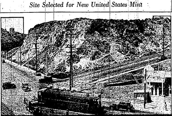
UNCLE SAM'S old mint in San Francisco, at Fifth and Mission streets, is out of date, so a new one will be erected on the block pictured here, now occupied by a rock promontory. The site is at the intersection of Duboce and Buchanan streets at Market street, the other sides being bounded by Hermann and Webster streets.

Evans & Son Coal & Coke Formerly Run by the THOMPSON'S FUEL SUPPLY We pay all Phone Calls over (5) five cents on one ton or over. Two Phones RE 7010-J-4 Farmington 3-80 6-p