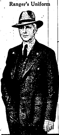
Rangers of the United States forest service have been fitted out with new uniforms as shown above. It is of very tough material known as bronze green leather. The coat is of loose-cut, single breasted style with leather buttons.