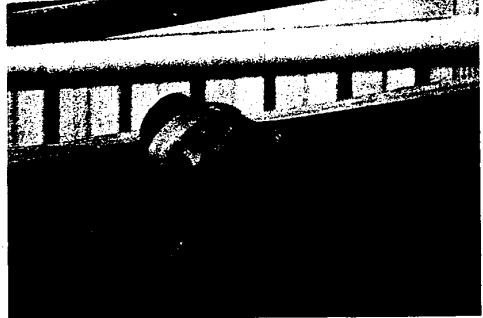
AND THEN there are those who have had enough and pick a nice sunny spot for an afternoon nap...just like this sleepy DRC patron.