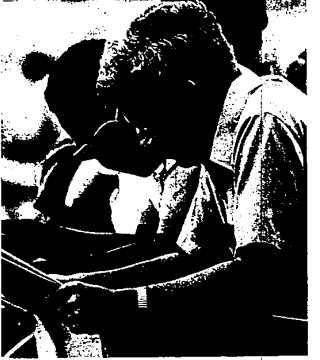
LOOKS GOOD in here says one better to another at the Detroit Race Course where the 120-day season ends Saturday. Scenes like this are a pattern of the daily programs.