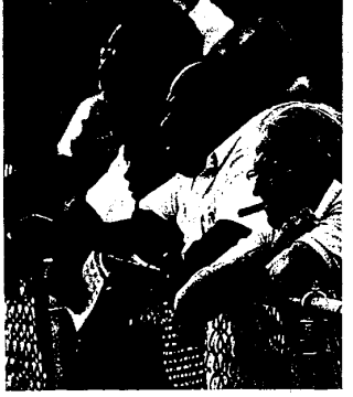
HORSES GET close inspection as they near the finish line. This shows spectators intently watching the field with little emotion.