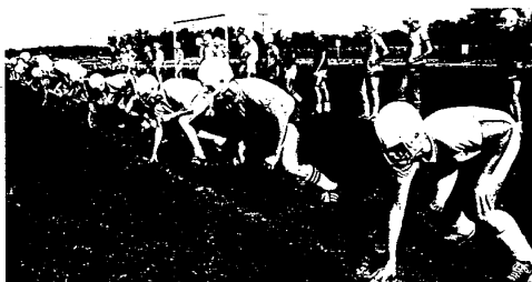
FAMILIAR SIGHT on area high school gridirons. Fall drills started Monday at every school with the exception of the three in Farmington. It was conditioning drills like this that had candidates sweating in the hot morning and late afternoon workouts.