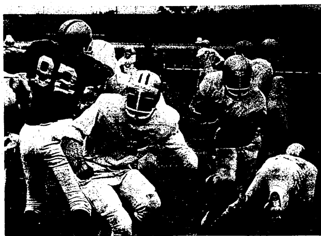
CONTACT WORK, especially on offensive maneuvers, has the attention of Farmington High gridders who finally started drills last