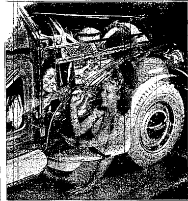
General Motors spent $250,000 to build a glass car for exhibition at the 1940 Golden Gate International Exposition. Alleen Poole (left) stretched out on the floor (glass) boards and Doris Hiltz crawled under the front fender to prove you can see through the machine.