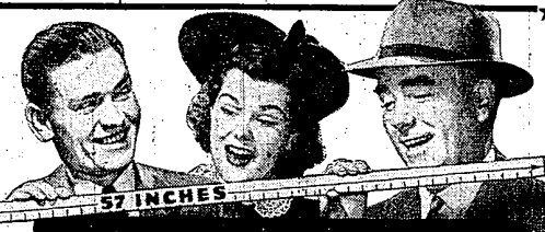
See how the '41 FORD outmeasures the "other two"!

SEE THE MAN WITH THE "MEASURING STICK"! LEARN ABOUT THE NEW FORD'S BIGNESS!