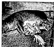
A Duroc Jersey sow with her litter of ten fine babies.

In the telephone, the successful hog raiser has an efficient, modern helper. He uses it regularly to help turn surplus grain into profitable pork, hams, and bacon and lard. He orders feed and keeps informed as to the trend of livestock prices by telephone. The same swift communication system directs the movement of pork-products from packing house to meat market to home refrigerator. A two-minute call to the store will bring you fresh country sausage or crisp bacon for tomorrow's breakfast!