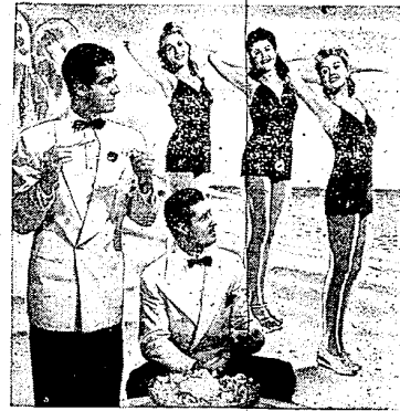
MOON OVER MIAMI