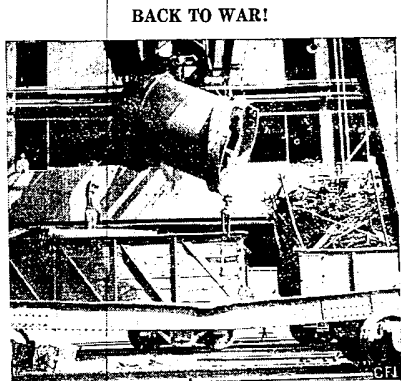
INDIANA HARBORS, IND.—An old mine hoist, shipped to the Inland Steel plants here from 20 years' storage at a Minnesota mine, is being unloaded and will be cut down to "pan size" by acetylene torches before being fired with equal amounts of pig iron on the open heart furnaces in the background building. From the furnaces this veteran of World War I will emerge as new steel plates for 1942's Liberty ships.