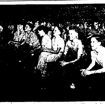
From the expressions on their faces, Father Flanagan's boys at Boys' Town, Nebraska, are enjoying a free show with Abbot and Costello.—Story by Trailer Vagabond.