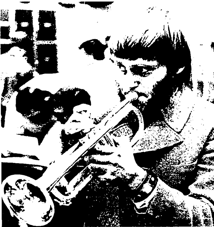
DON ELLIS, composer of the score for "The French Connection," will appear at Clarenceville this season.