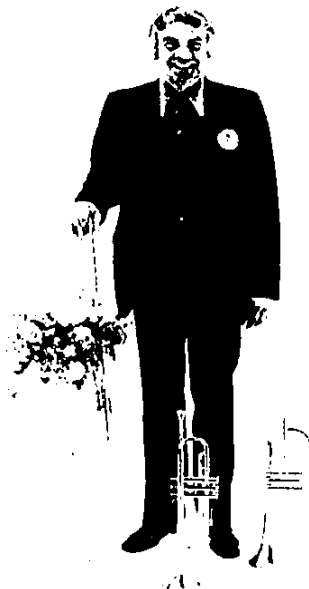
MAYNARD FERGUSON will perform at Clarenceville in his first midwest tour.

And so Clarenceville, named for a 19th century pioneer farmer, has become a kind of mecca for professional entertainment -- the only suburban spot for miles which offers that caliber of music, drama and the dance.