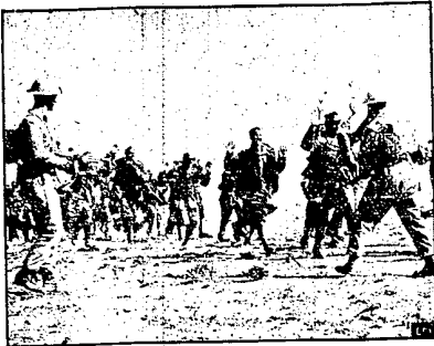
TUNISIA—Pictures of Italian soldiers surrendering have become a common thing. Here is a large haul of Italians, hands raised, rushing to surrender to the few British soldiers who have been feeding them lead on the Tunisia Desert. Between March 20 and April 12, 1943, the British Eighth Army took 20,000 prisoners.

pressure cookers which will be produced in 1943 will be rationed by county farm rationing committees, to users showing greatest need for them. Community organizations composed of several families who agree to use a pressure cooker jointly will get first consideration.