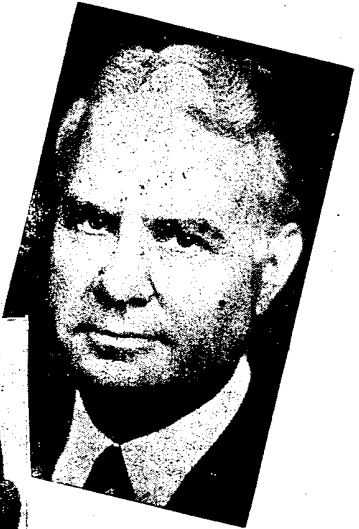
JOHN W. BRICKER for VICE-PRESIDENT