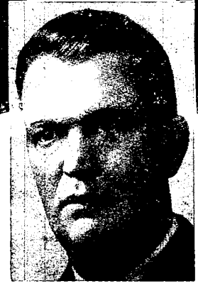
HARRY F. KELLY for Governor