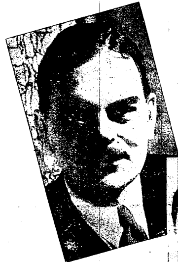
THOMAS E. DEWEY for PRESIDENT