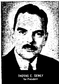
THOMAS E. DEWEY for President